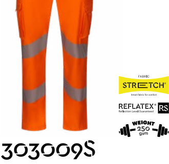
Stretch trousers with segmented tape